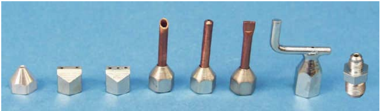
985225 1 HOLE 985110 2 HOLE 985111 3 HOLE 985112 EXTENSION 985113 NEEDLE 985114 SPREADER 985115 'L' NOZZLE 985088 NOZZLE ADAPTOR